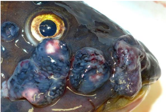
Cysts of Myxobolus sp. in common carp.