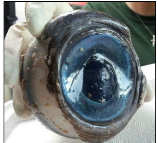
Picture of giant eyeball

When a giant (softball-sized) eyeball washed ashore in Pompano Beach, Florida and went 'viral' on You-Tube , numerous and diverse hypotheses were offered by expert biologists and university professors as to the origin of the eye 'donor'. Offerings that gained the most traction were giant squid, bigeye thresher shark, and any of the billfishes. While it can be fun to speculate, in cases when only a part of an animal is recovered, species identification by visual