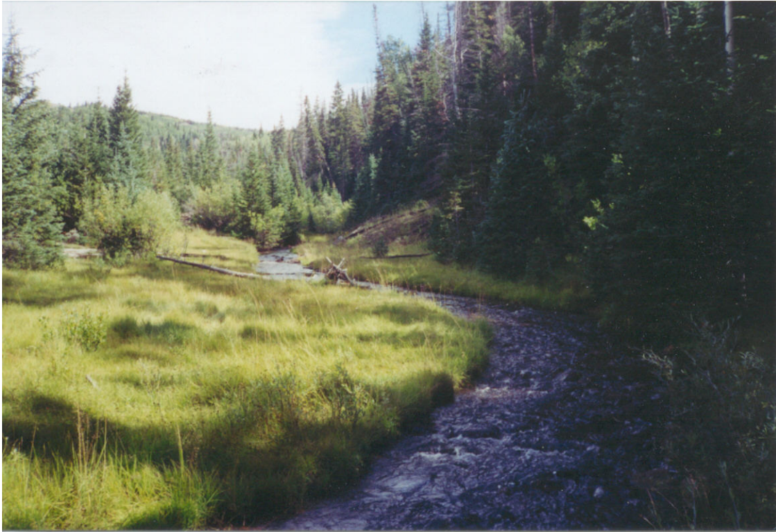
Photo 1: Station D on upper Manning Creek about 1 mile below Manning Meadow Reservoir. This station has been monitored from 1988 to 1999, providing the longest series of aquatic macroinvertebrate data on Manning Creek. Data from four other stations for shorter time spans also was used in this study.