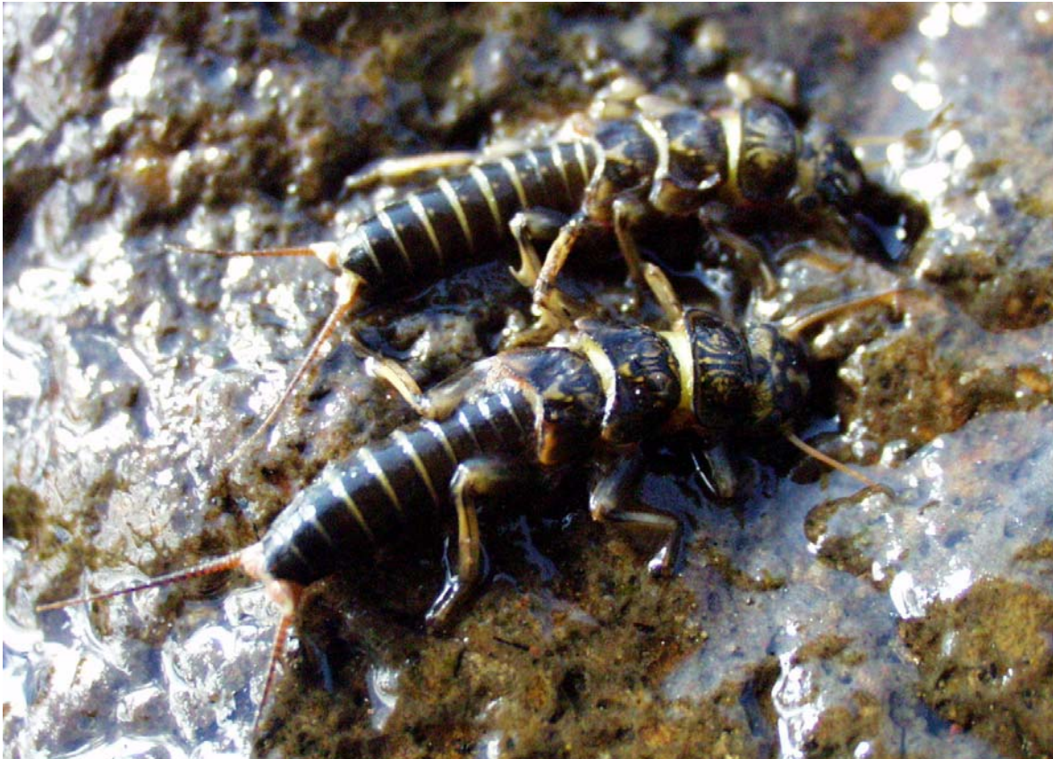
Hesperoperla pacifica , a stonefly found in Manning Creek both before and after the 1995 and 1996 rotenone treatments.